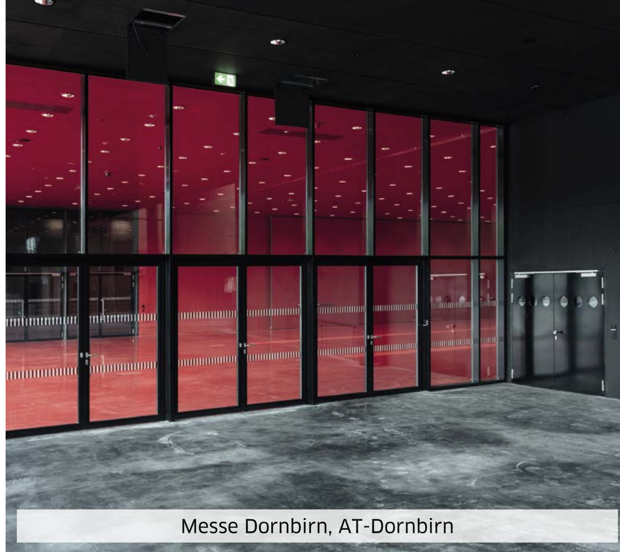
Messe Dornbirn, AT-Dornbirn