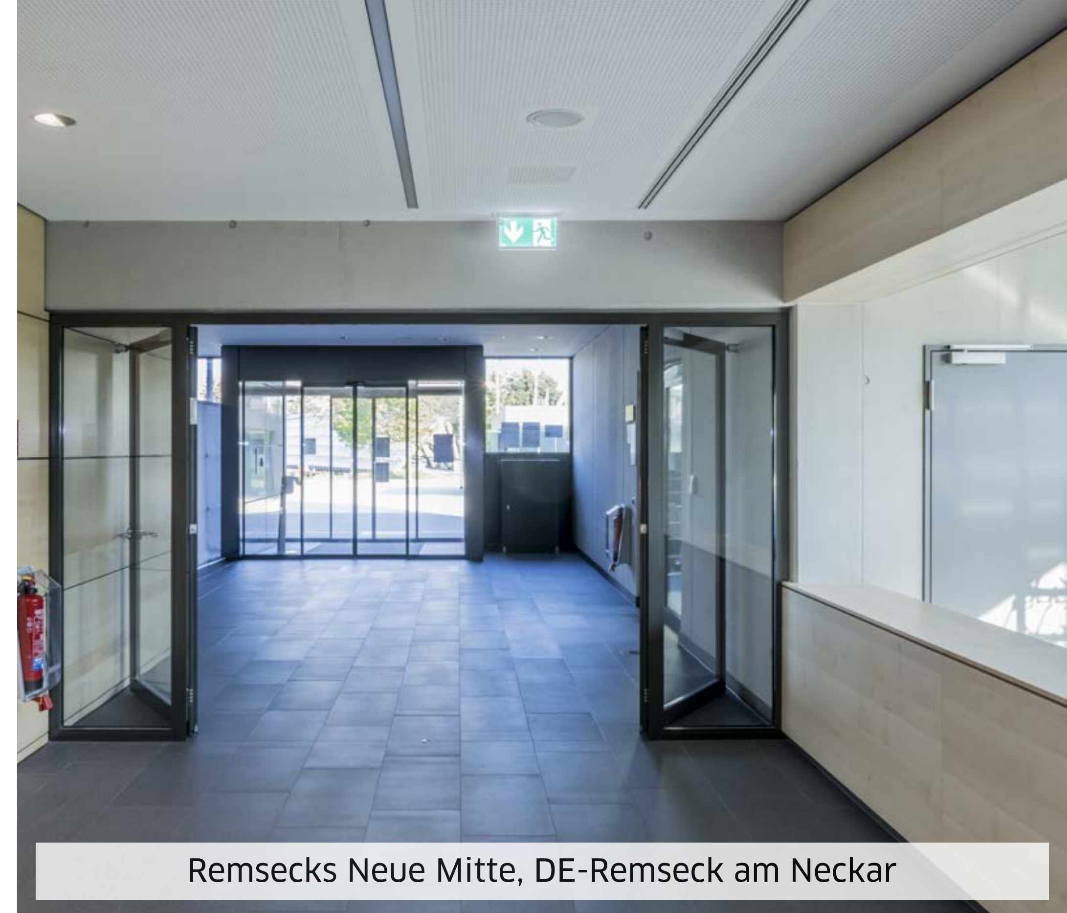
Remsecks Neue Mitte, DE-Remseck am Neckar