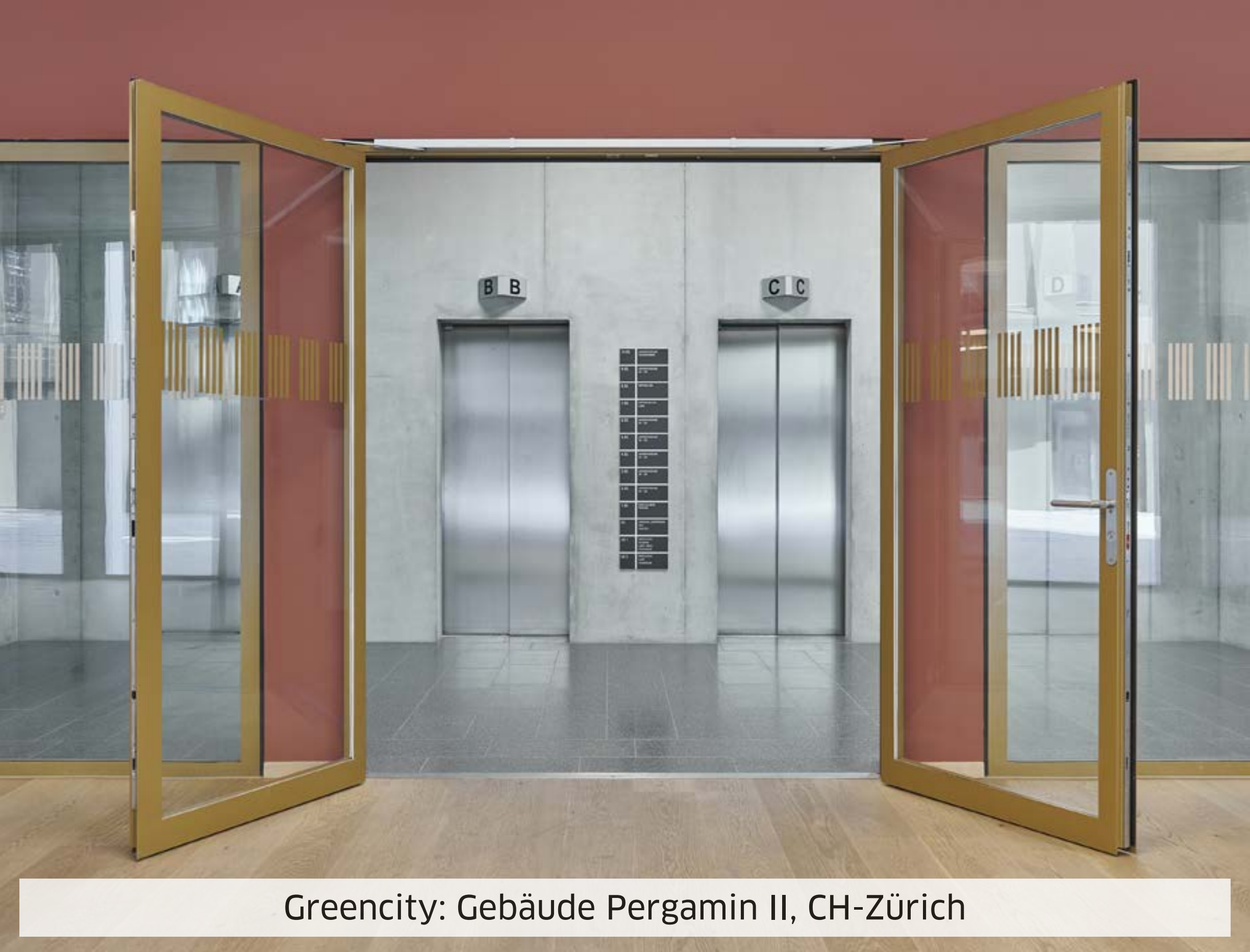
Greencity: Gebäude Pergamin II, CH-Zürich