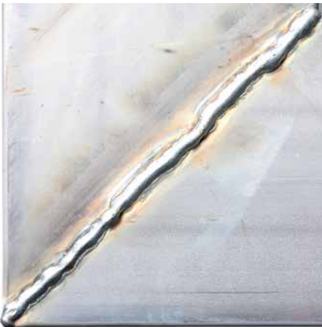
Weld seam with ZF 100 surface finish

The particularly defined microstructure of the ZF alloy coating forms an adhesive protective layer on the steel and is characterised by a uniformly fine-grained crystal structure with a high surface quality and optimum coating adhesion.