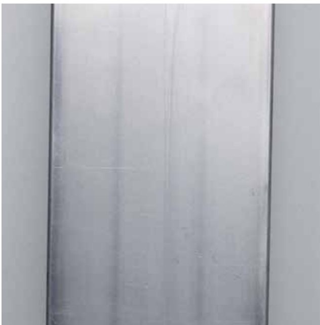
ZF 100 surface finish