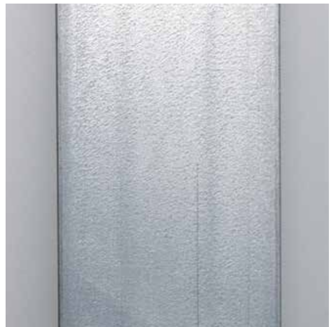
Z 275 surface finish